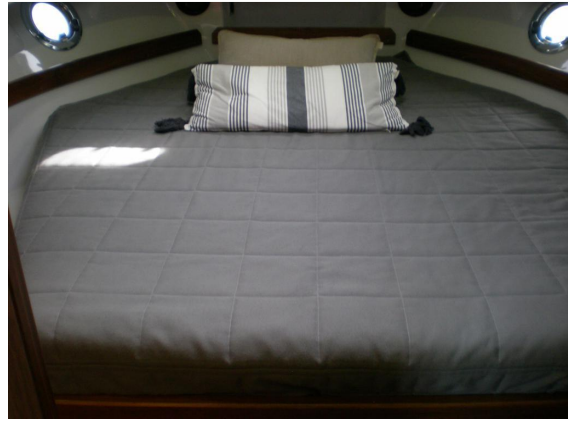
Sargo 36 Explorer - forecabin