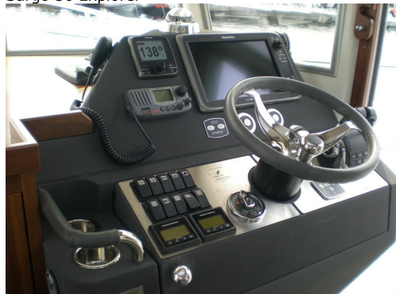
Sargo 36 Explorer - helm