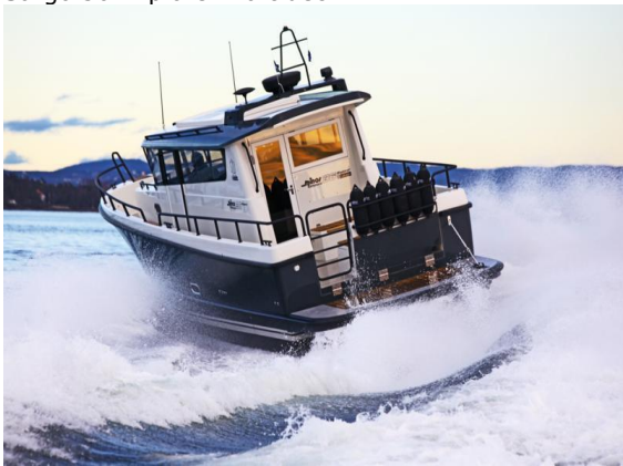
Sargo 36 Explorer