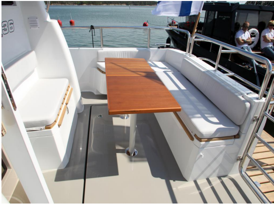
Sargo 36 Explorer - aft deck