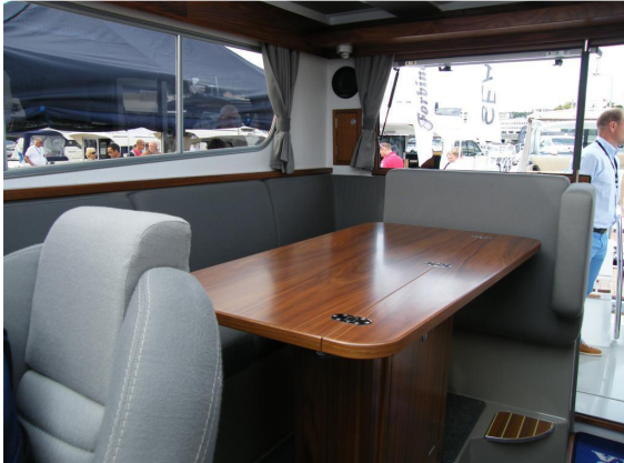
Sargo 36 Explorer - saloon