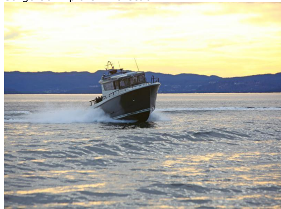
Sargo 36 Explorer